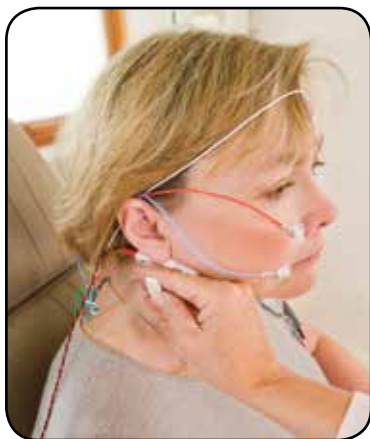
Bar electrode with handle is easy to place over the stimulation site

Trusted Reliability. Flexible Innovation. Proven Excellence.