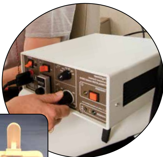
Digitimer SEP Stimulator