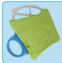
Preemie lime For babies weighing less than 1,800-2,000 grams (4-5 lbs)