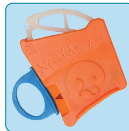
Full-term mango For babies weighing more than 1,800-2,000 grams (4-5 lbs)