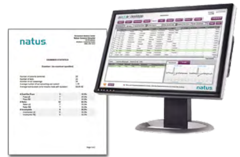
audble Data Management