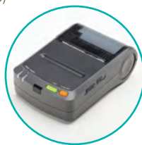
Bluetooth Wireless Label Printer