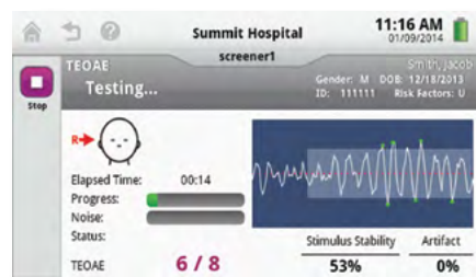
TEOAE Testing in Progress