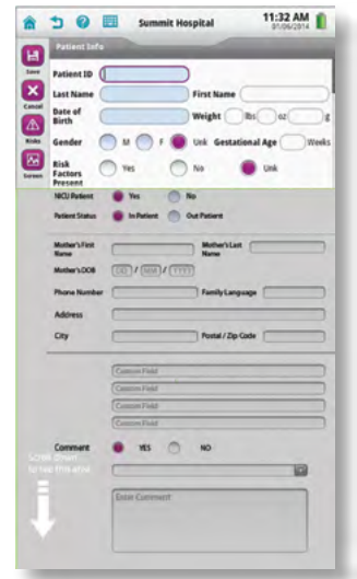
Comprehensive Patient Data