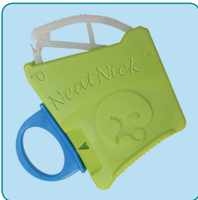
Preemie Lime Green