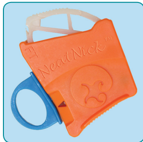
Full-term Mango Orange