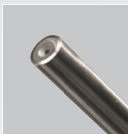
RESILIENT SAPPHIRE LENSES