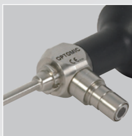
STAINLESS STEEL BODY