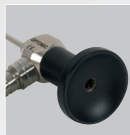
PEEK EYEPIECE LENSES