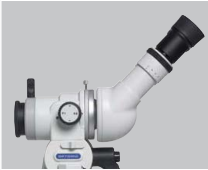
INCLINED BINOCULAR HEAD