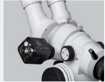
OPTIONAL VIDEO SYSTEM