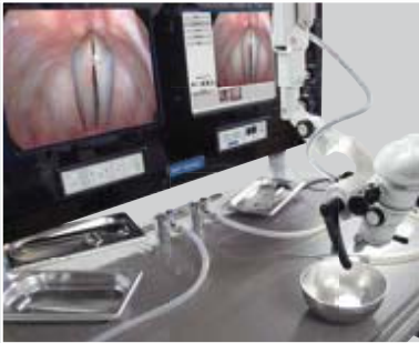
DOUBLE MONITOR SYSTEM