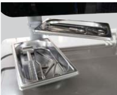
TRAY FOR INSTRUMENTS