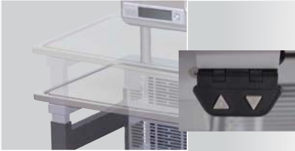
ELECTRICAL UP & DOWN MOVEMENT

The integration of a complete endoscopic unit, microscope and milling equipment turn OP-LAB2 Unit into a unique product in this branch. The central suction and irrigation systems facilitate a proper maintenance of the unit and increase the users' comfort due to minimizing the surrounding noise.