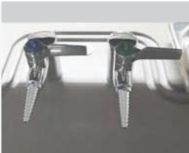
DOUBLE CENTRAL CIRCUIT